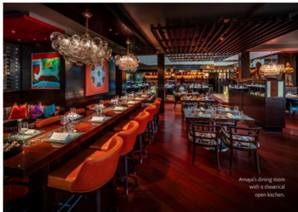
Amaya's dining room with its theatrical open kitchen.