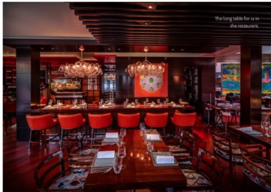
The long table for 12 in the restaurant.