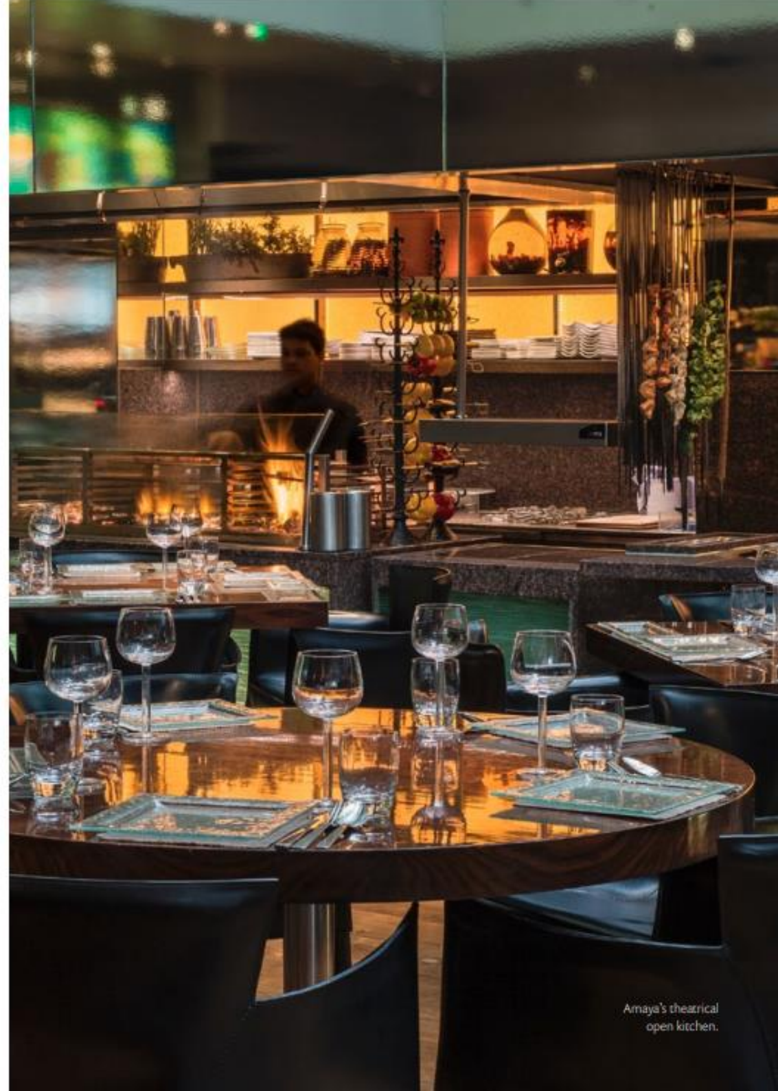
Amaya's theatrical open kitchen.

Halkin Arcade, Belgravia, London SW1X 8JT | privatedining@fineindianrestaurants.com amaya.biz