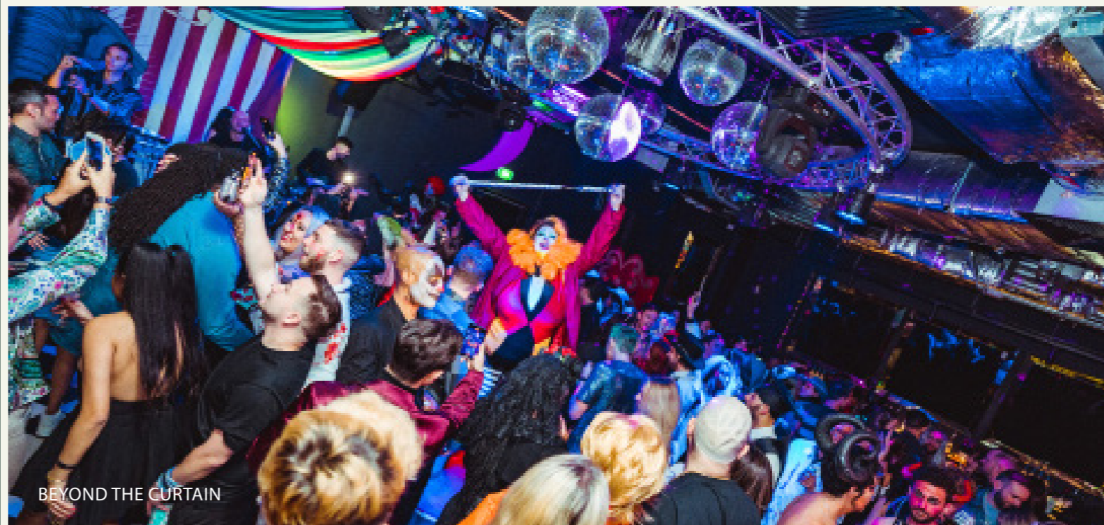
BEYOND THE CURTAIN

Take over the three individual spaces that make up The Curtain Club's lower ground floor. Use each room for different immersive experiences or break out areas, or for a blowout party across all three rooms.