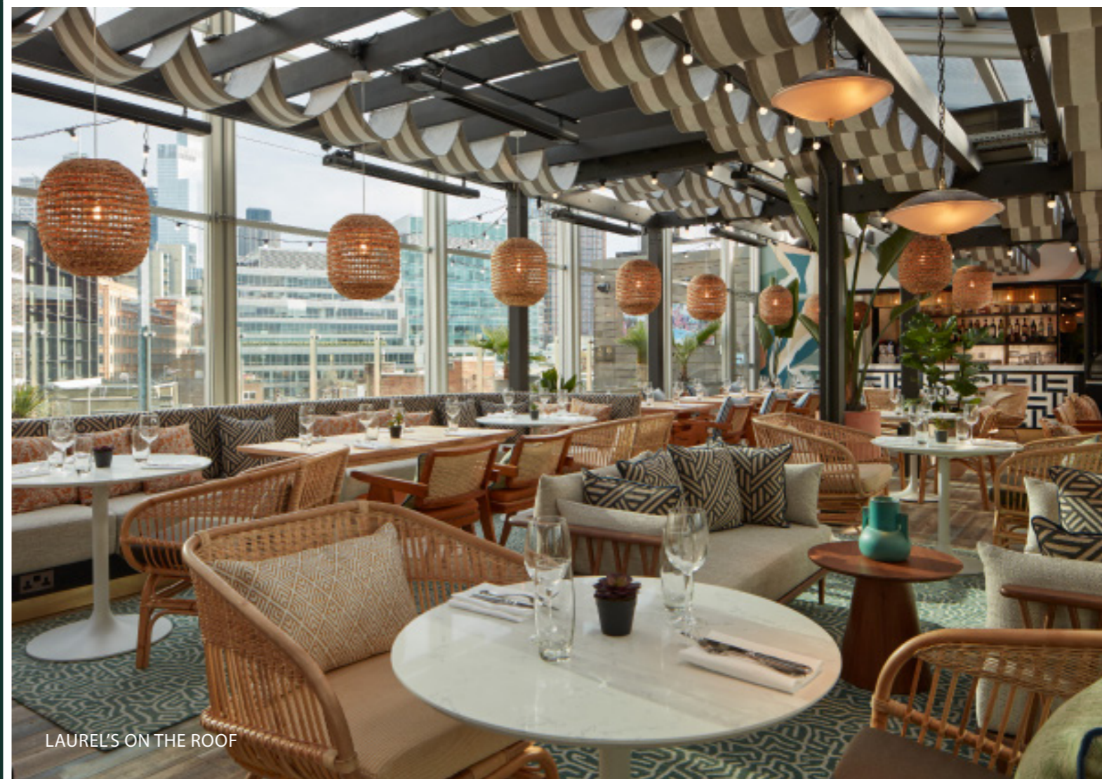
LAUREL'S ON THE ROOF

With the ability to host up to 56 guests seating or 120 standing inside, Laurel's On The Roof will transport your guests from London straight to LA with a menu that draws upon Californian classics.