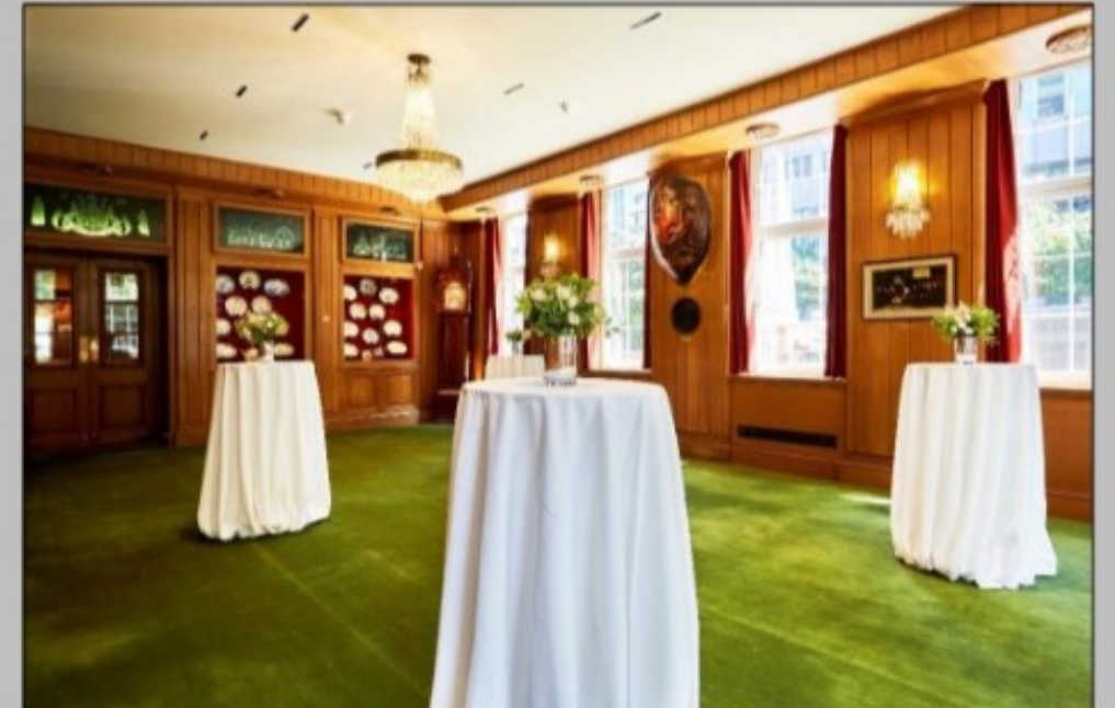
The Reception Room