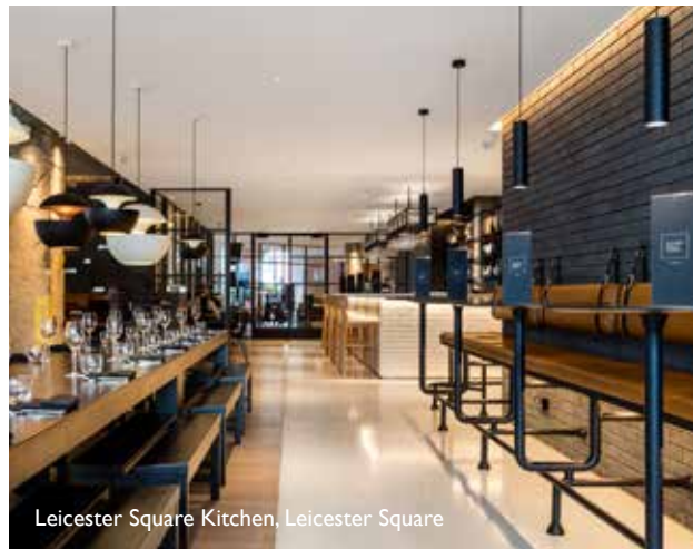
Leicester Square Kitchen, Leicester Square