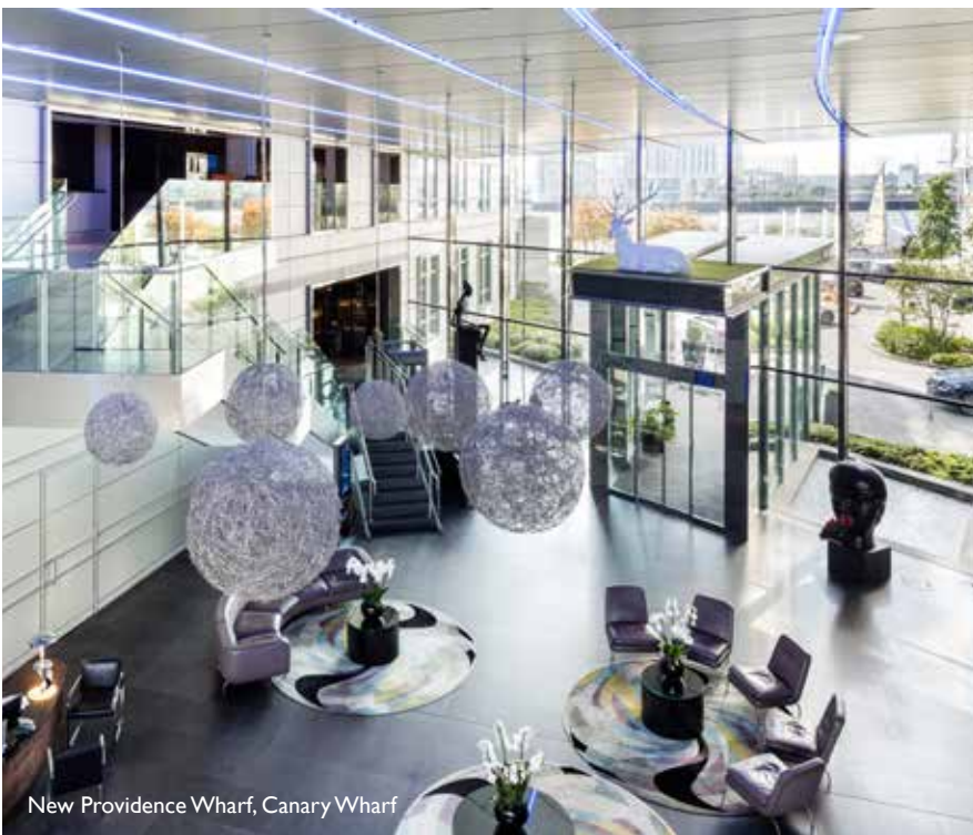
New Providence Wharf, Canary Wharf