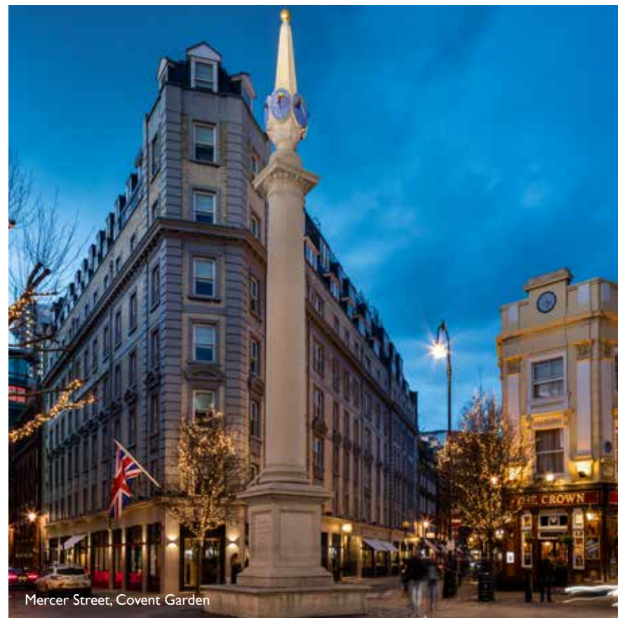
Mercer Street, Covent Garden