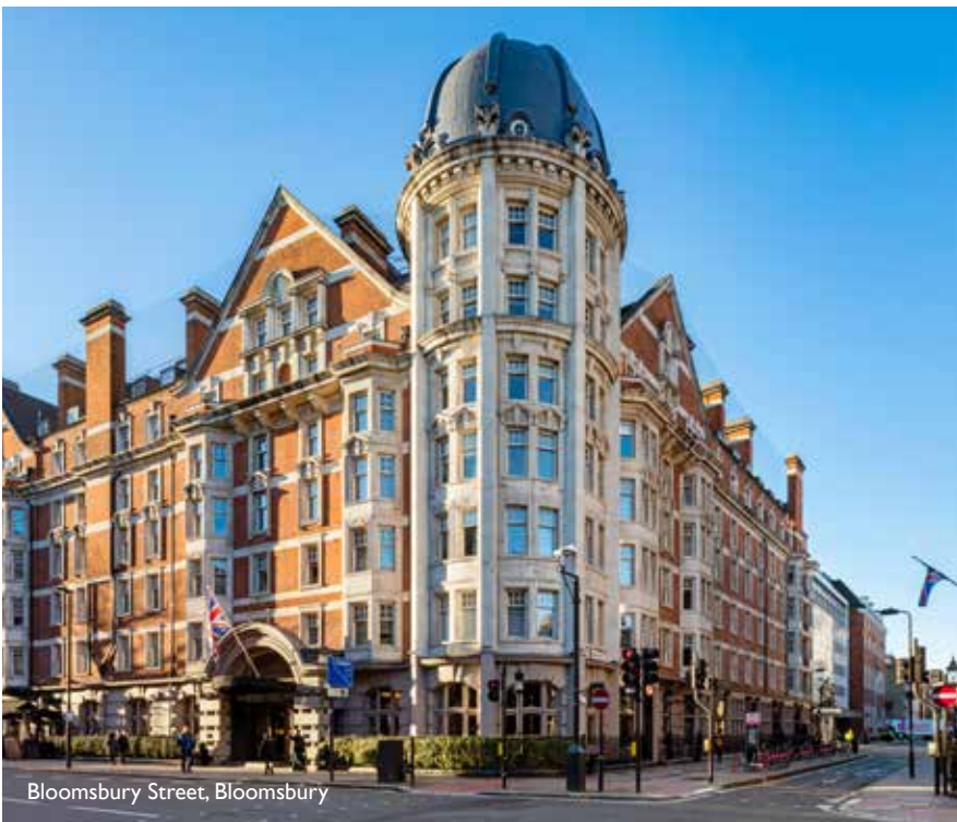
Bloomsbury Street, Bloomsbury