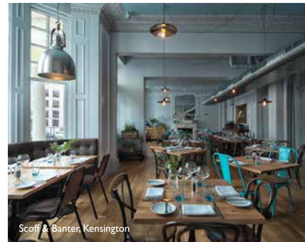
Scoff & Banter, Kensington