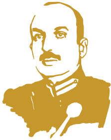
-Brigadier- Y.P Sethi