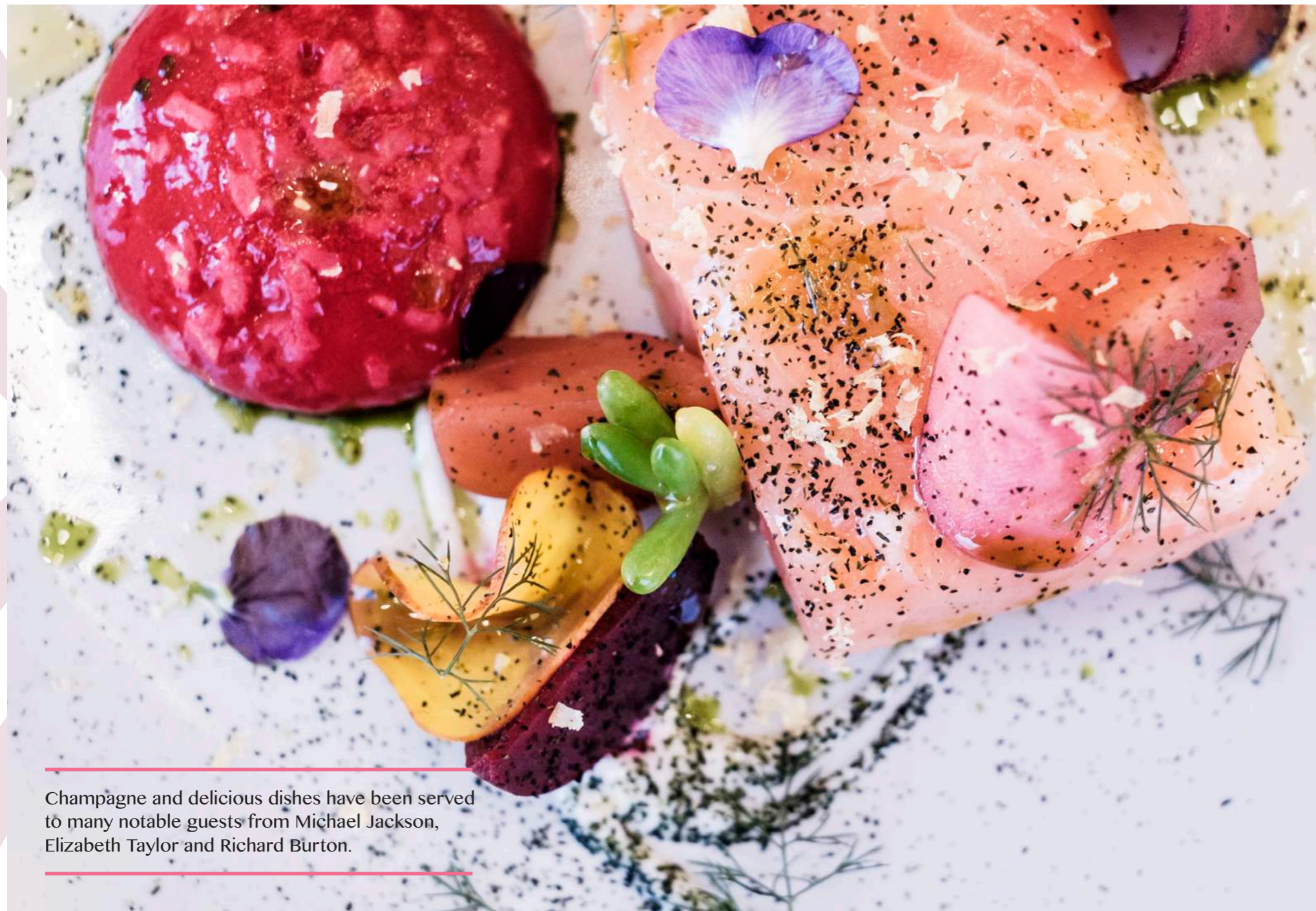
Champagne and delicious dishes have been served to many notable guests from Michael Jackson, Elizabeth Taylor and Richard Burton.