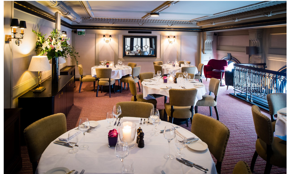
Large Private Dining Room at St James's Capacity: 50 people for drinks and canapés For 36 diners, we set up 6 tables of 6 people