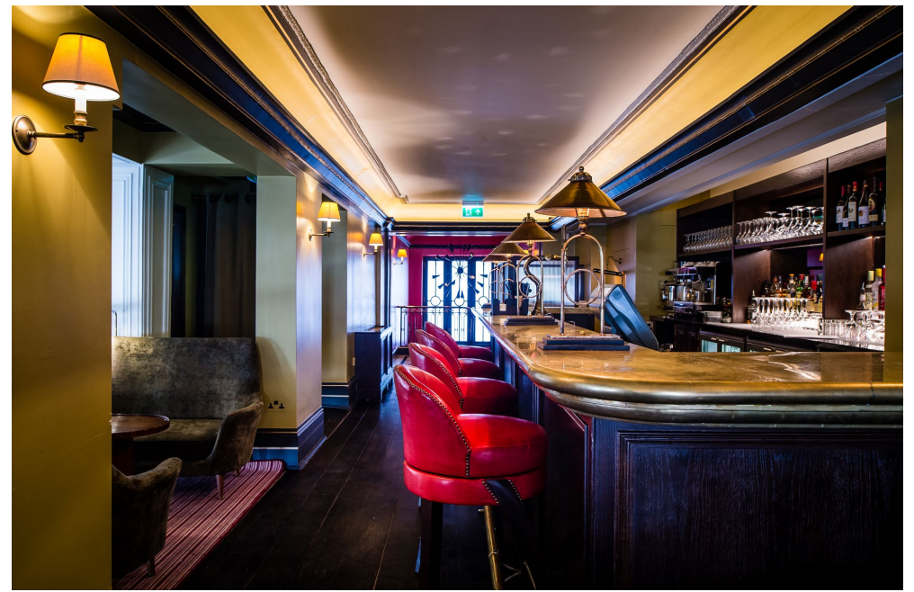
Exclusive bar available on the Mezzanine at St James's