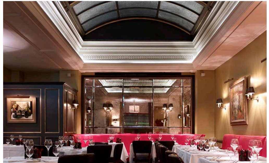
Villandry St James's, 12 Waterloo Place, SW1Y 4AU · +44 (0)20 7930 3305 Twitter: @villandry_uk Facebook: Villandry-Grand-Cafe