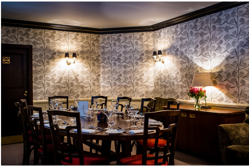
Small Private Dining Room at St James's - Seats up to 12