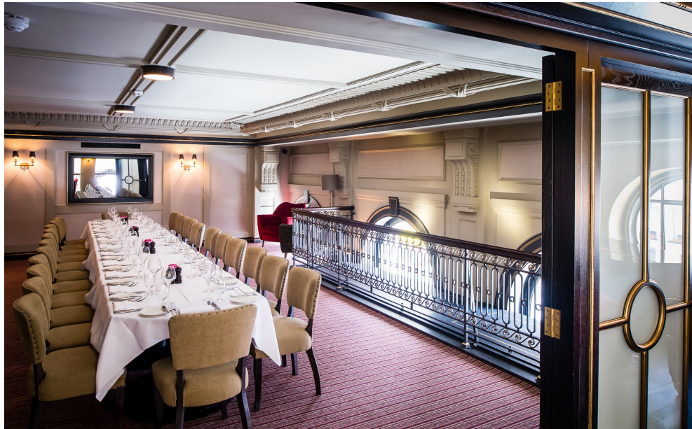
Large Private Dining Room at St James's Capacity: 50 people for drinks and canapés For dining, 24 on one long table