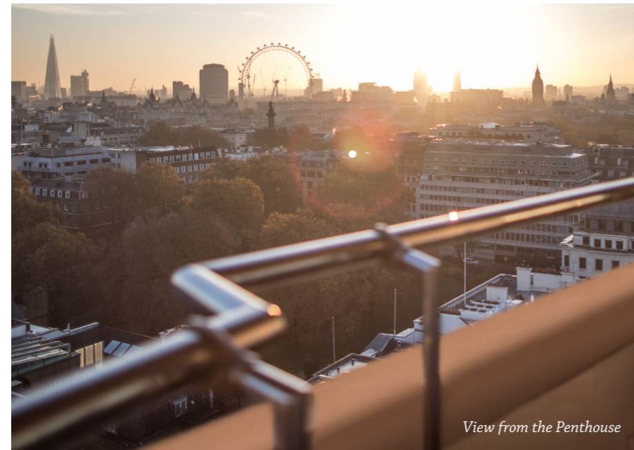
View from the Penthouse