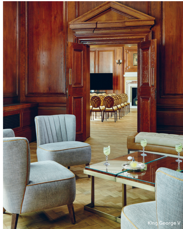
King George V

It is this seamless blend of historic charm and thoughtful, modern convenience that sets London Marriott Hotel County Hall apart, both as a hotel and a meetings and events destination. Add to that our incredible riverside location, offering uninterrupted views of Big Ben and the Houses of Parliament, and you have a truly compelling experience to offer your guests.