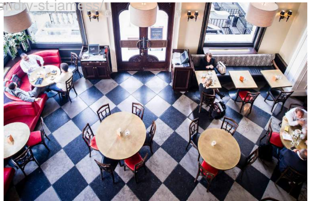
Café: up to 70 guests seated capacity.