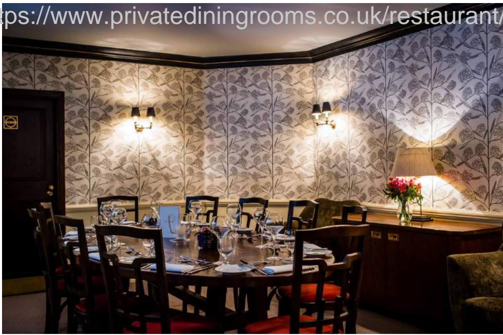
Small Private Dining Room at St James's - Seats up to 12