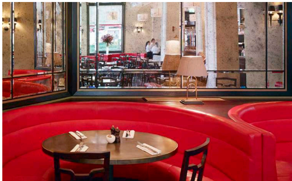
Restaurant: up to 100 guests standing capacity.