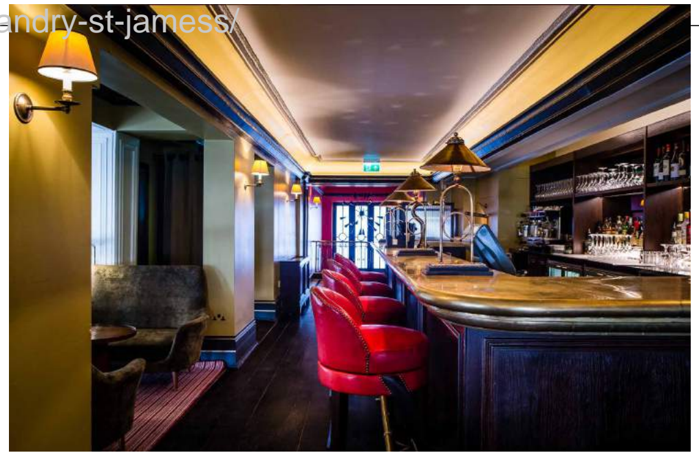
Exclusive bar available on the Mezzanine at St James's