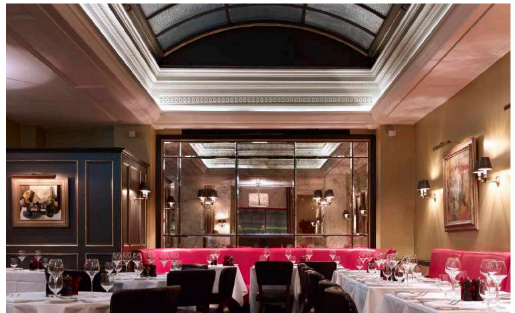
Restaurant: up to 100 guests seated capacity.