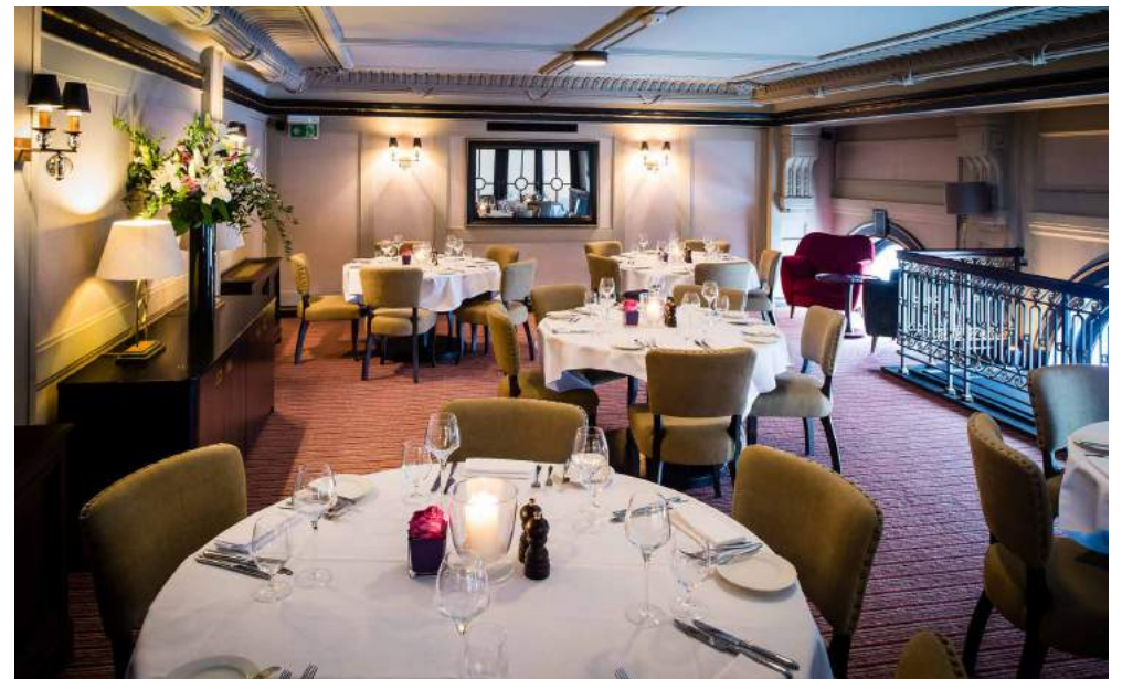
Large Private Dining Room at St James's Capacity: 50 people for drinks and canapés For 42 diners, we set up 6 tables of 7 people