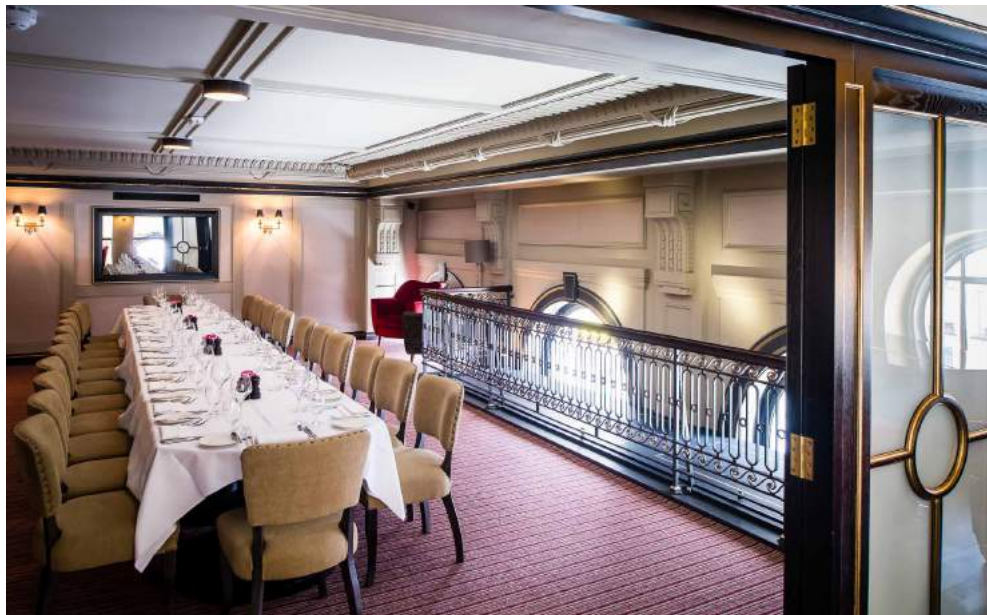
Large Private Dining Room at St James's Capacity: 50 people for drinks and canapés For dining, 26 on one long table