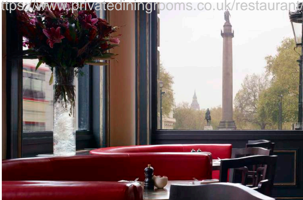
Café: up to 150 guests standing capacity.